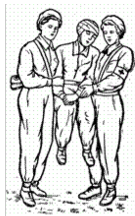
Рис. 71. Переноска на ямке двумя носильщиками